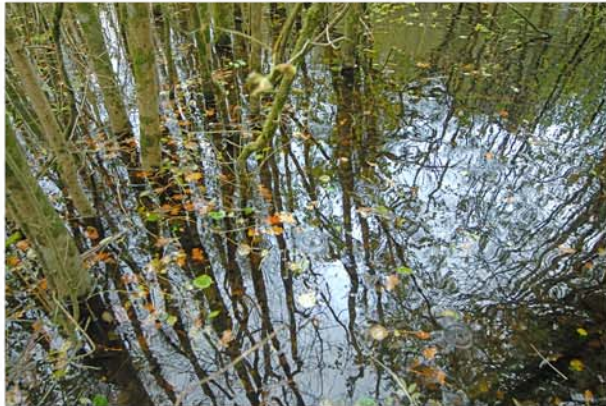
Wet hollow, Coole Park