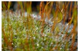
Clockwise from upper left: Autumn puffball, Derrydonnell autumn, Winter velvet, After the rain (springtime in the woods), Fiddleheads, Frosty moss, (below) Spring emerging, Elm turlough, Universe