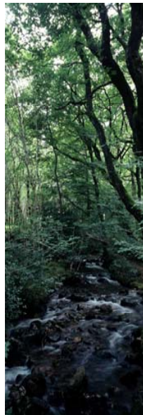
Woodland stream, Wicklow