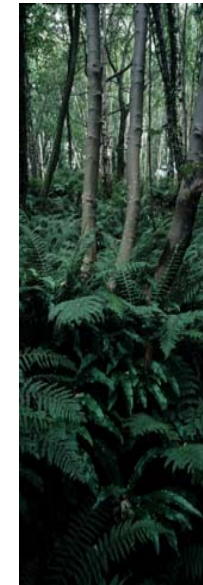
Ash and fern, Wicklow