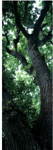
Oak crown, Dublin