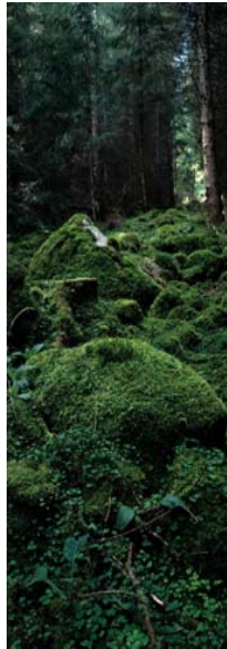
Spruce forest, Wicklow