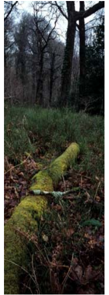
Log and fraochán, Wicklow