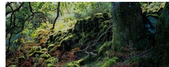
Oak and stone wall, Wicklow